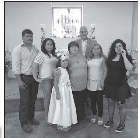
Confirmation and First Communion at Bethel Lutheran of Laredo.