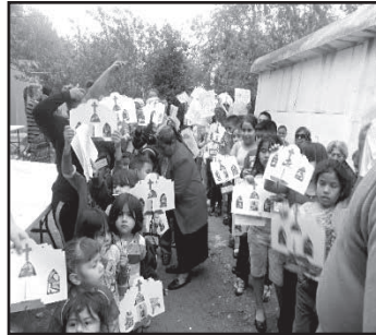
Kids at VBS.

St. John Mission Society of North Branch, Minnesota which has made many mission trips to the L.A.L.M. and the churches of Mexico arrived with another group of eager volunteers for four days of service in March. Among their projects they repaired the home of a single mother who had suffered a severe burn accident. They also presented three VBS for children in three different areas of Nuevo Laredo, MX. They brought donated food to each location. Most importantly they joyfully brought the Gospel message.