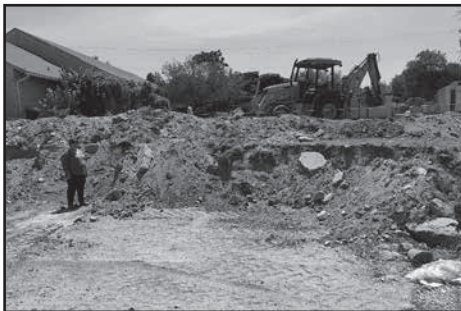
Excavation near "Living Water" Lutheran.

Activities here on the border continue developing well. The missions in Nuevo Laredo, MX are growing with special activities for the children and youth. The annual womens' conference, always a high point, is planned for later this summer.