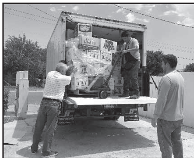
Unloading is a big job.

If one member suffers, all suffer together; if one member is honored, all rejoice together.