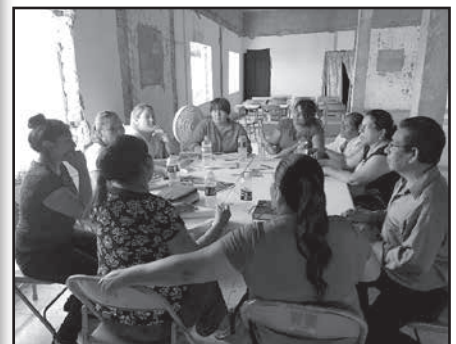
E.L.C.M. women plan the womens' summer conference.