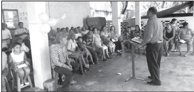
Learning how to care for the elderly.