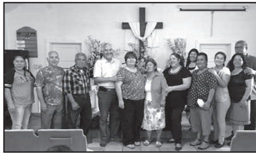
Pastors who help with the food distribution program.