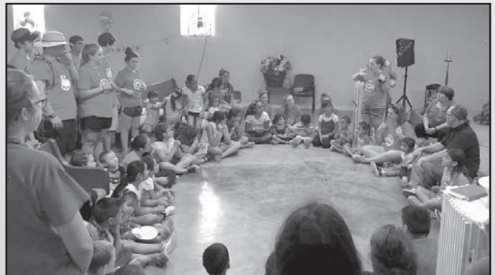
Calvary Lutheran at work with “Living Water” Lutheran.