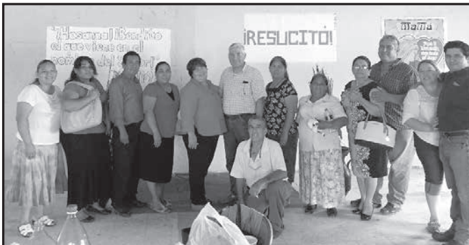
House church leaders of Nuevo Laredo, MX