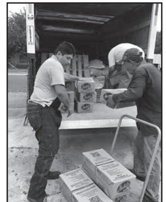
Unloading the donated food.

Two hospitals including General Hospital of Nuevo Laredo, MX and the Mexican Red Cross received medical equipment, crutches, walkers, first aid materials and more. The nutrition program called "The Blessing" on the border, through the help of our Mexican co-workers brought material and spiritual food to thousands each week.