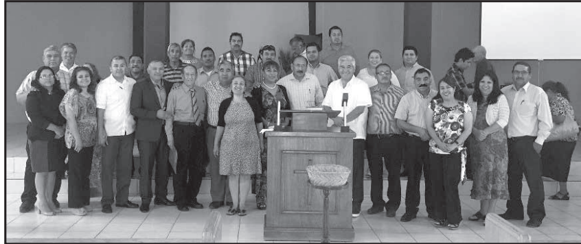
Lutheran pastors at semi-annual conference in Saltillo.